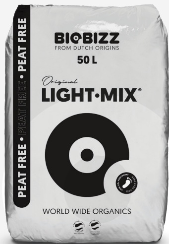
BORSE 20L, 50L